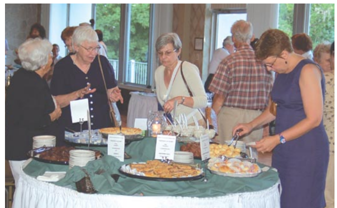
Desserts at Dusk fundraiser offered many "sweet" options for those who attended.

Many local businesses also donated raffle items to the event. We are grateful for all the support from our local community. If you missed this year's party, don't worry, plans are underway for Desserts at Dusk 2008!